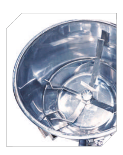
S.S Mixing Agitator