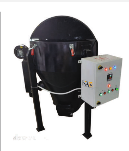
Mixer with Dryer